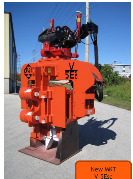
New MKT V-5Esc